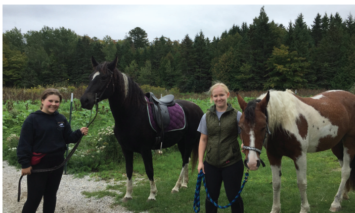
Members of the American Curly Horse Association.