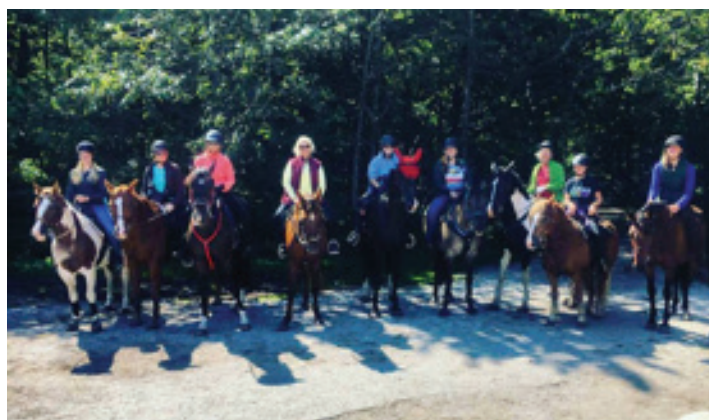
A group of trail riders ready to head out and explore the island.

As we move into the off-season at the Mackinac Community Equestrian Center, we reflect on our accomplishments and growth throughout the season. 2017 was successful for all of our programs, including our short-term boarding program. Our accommodations offered a "Bed and Breakfast" to many horses, filling over 140 stall nights throughout the season. This program is utilized by both individuals and groups, some of which have included the Eaton County Mounted Unit and the American Curly Horse Association.