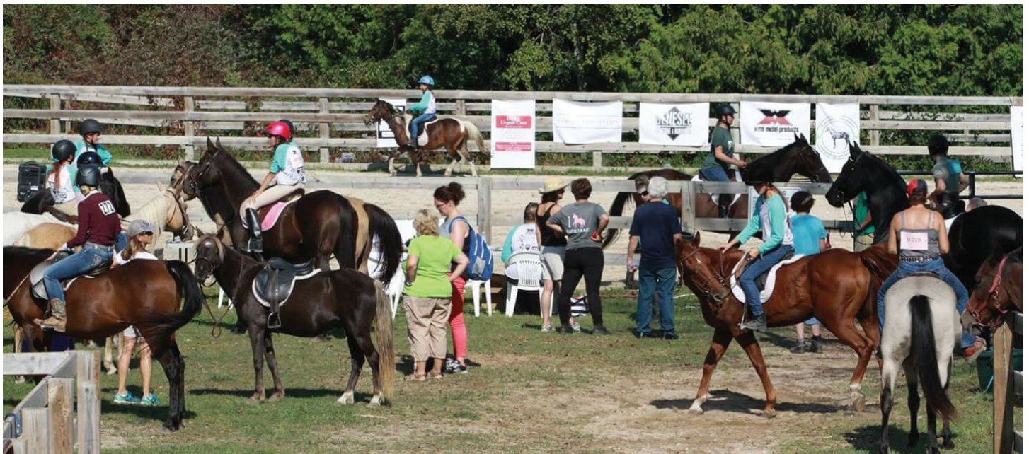
Activities at the Dr. Edwin and Jean Deer Horse Show held at the Mackinac Community Equestrian Center Sept. 23-24. Three 4-H groups participated and all Mackinac Island riders were invited to attend.